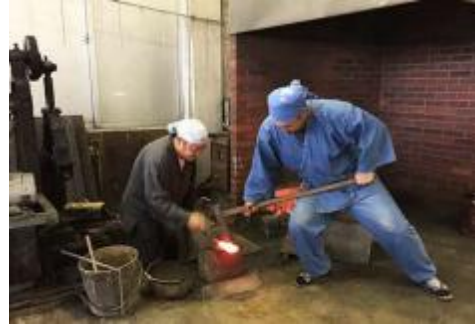
Performance of Japanese sword making in Oku-Izumo