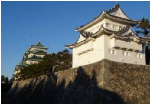
South-western Tower of Nagoya Castle