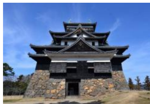
Matsue Castle, Tenshu