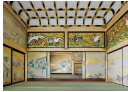
Interior of Honmaru Palace in Nagoya Castle

The detail of the post-conference excursion will be announced by the 4th Circular on 13 July. Those who want to participate in the excursion will be requested to register and pay the travel expense by the middle of August.