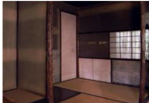
Joan Tea House in Uraku-en Garden (Inuyama)