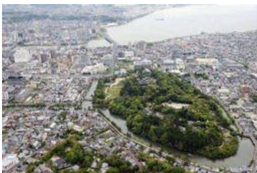
Matsue Castle, Bird's eye View