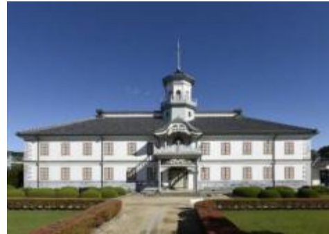
Kaichi School (Matsumoto)