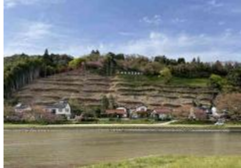
Site of Mitoya Fortress