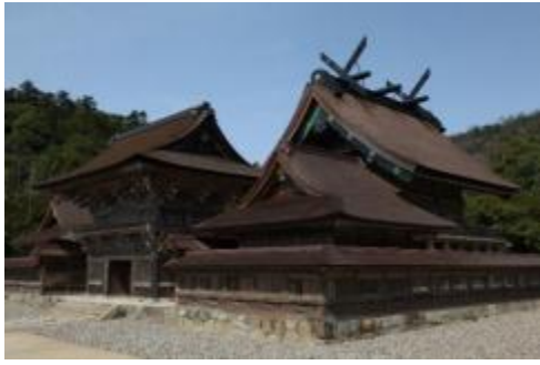
Izumo Great Shrine